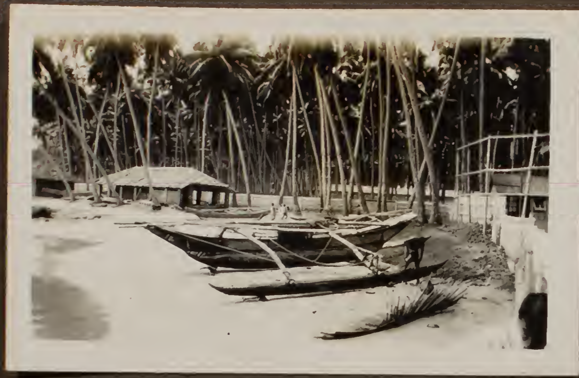
Catamarans at Mount Lavinia